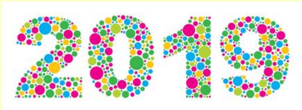
The official School Magazine

Would you like a keepsake of all things 2019?! The Caddies Creek Courier is a great way to look back on all the fantastic things that have happened over this extremely busy year. The Courier is produced as a bound book and is only $5.00 . The Courier includes work from every child in the school and many other articles including sports reports, excursion adventures, school events, puzzles, colouring in pages and lots more! To pre-order your copy of the Courier, please complete the slip below and return it with $5 to the collection boxes outside the front office.